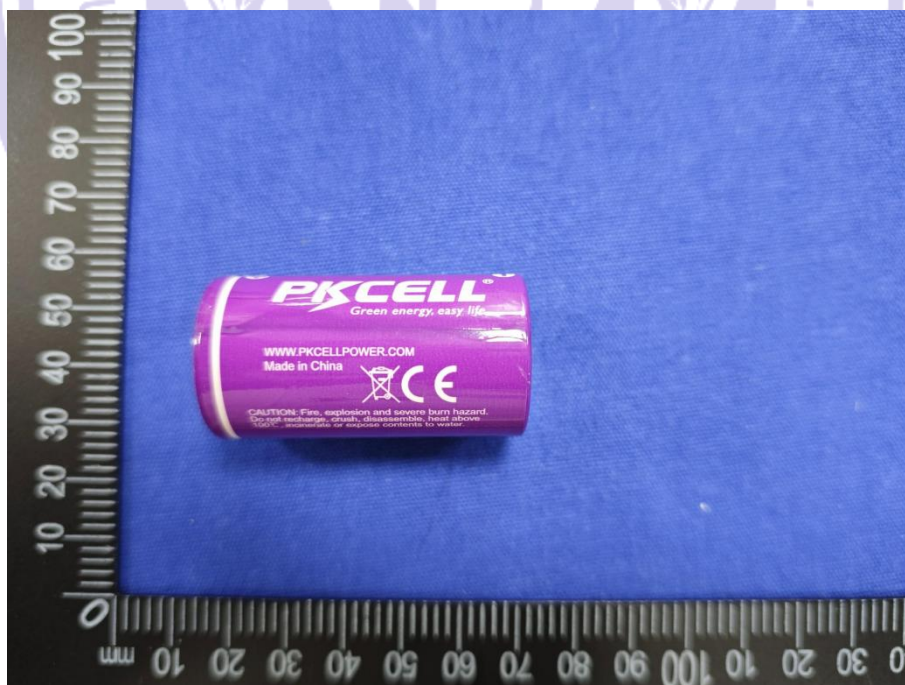
Photo 2 Rear 反面