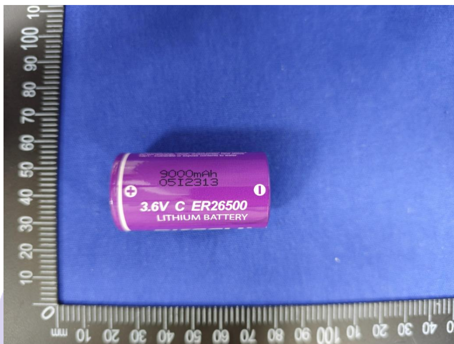
Photo 1 Front 正面